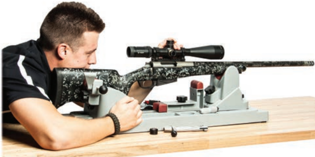
Visually bore-sighting a rifle.