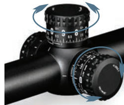
Windage Turret Dial