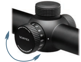
Adjust the side focus knob

Parallax is a phenomenon that results when the target image does not quite fall on the same optical plane as the reticle within the scope. When the shooter's eye is not precisely centered in the eyepiece, there can be apparent movement of the target in relation to the reticle, which can cause a small shift in the point of aim. Parallax error is most problematic for precision shooters using high magnification.