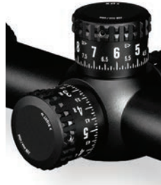
MOA Adjustment 1 Click = 1/8 MOA

MOA unit of arc measurements are based on degrees and minutes. A minute of angle will subtend 1.05 inches at a distance of 100 yards (29.1 mm at 100 meters). This riflescope uses 1/8 minute clicks which subtend .13 inches at 100 yards (3.6 mm at 100 meters), .26 inches at 200 yards (7.2 mm at 200 meters), .39 inches at 300 yards (10.8 at 300 meters), etc.