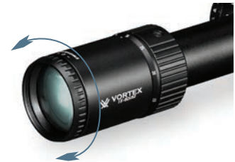
Adjust the reticle focus

Once this adjustment is complete, it will not be necessary to re-focus every time you use the riflescope. However, because your eyesight may change over time, you should re-check this adjustment periodically.