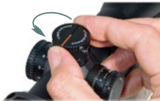
Correct alignment for zero point.