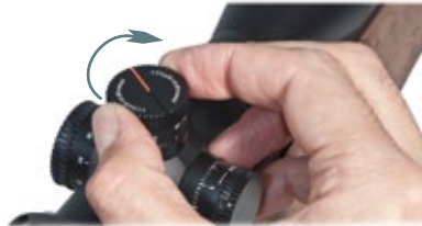
Point at which the knob stops turning.

Note: If re-zeroing at a future time, be sure to remove all CRS shims before sight-in.