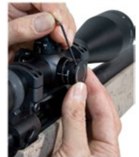
Align the windage turret cap.

Once the windage and elevation knobs are correctly indexed to the zero mark, temporary corrections can be safely dialed into the scope without worry of losing the original zero.