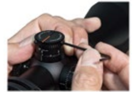
Align the elevation turret cap.